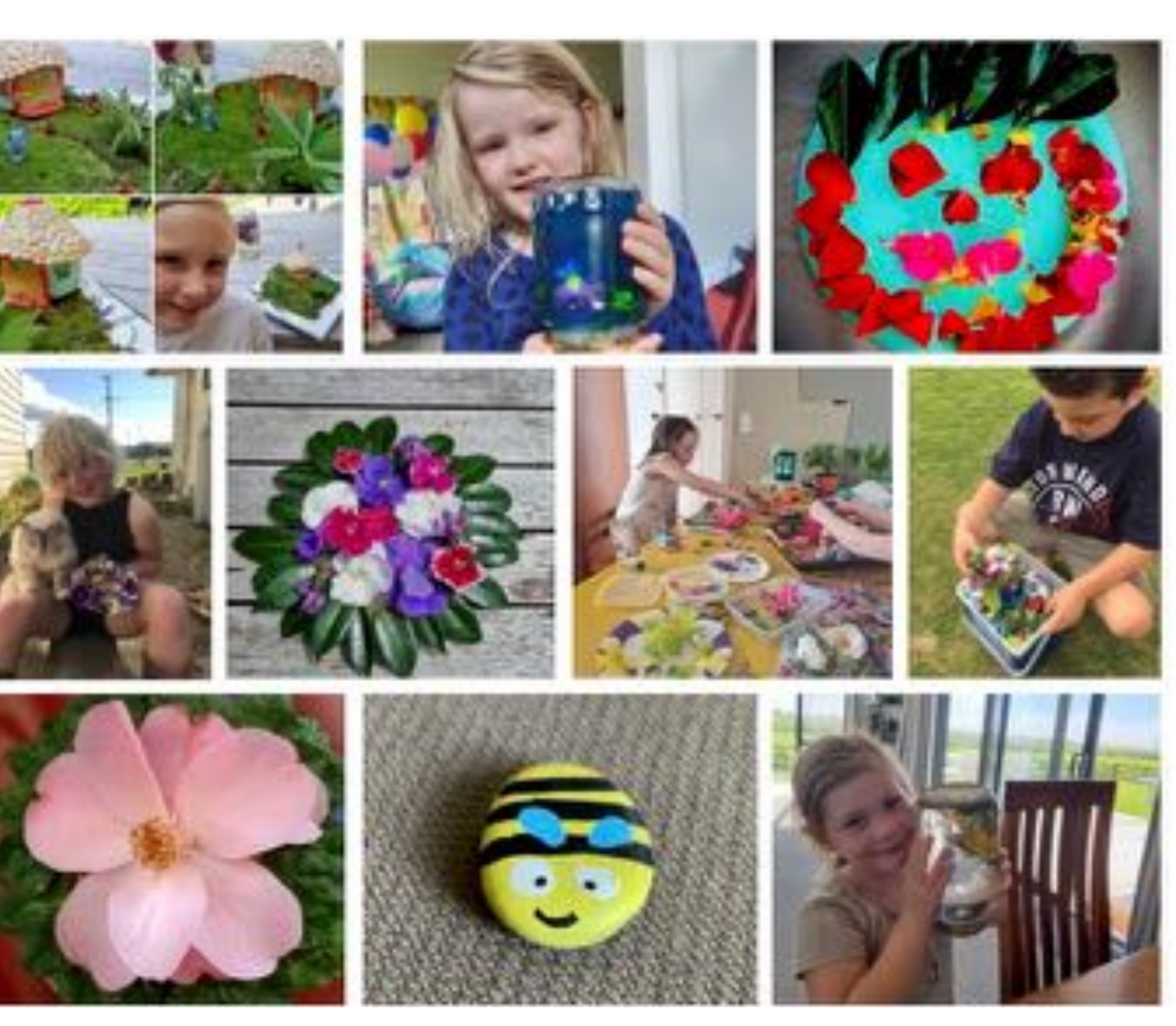
Look at these wonderful Flower Day creations: