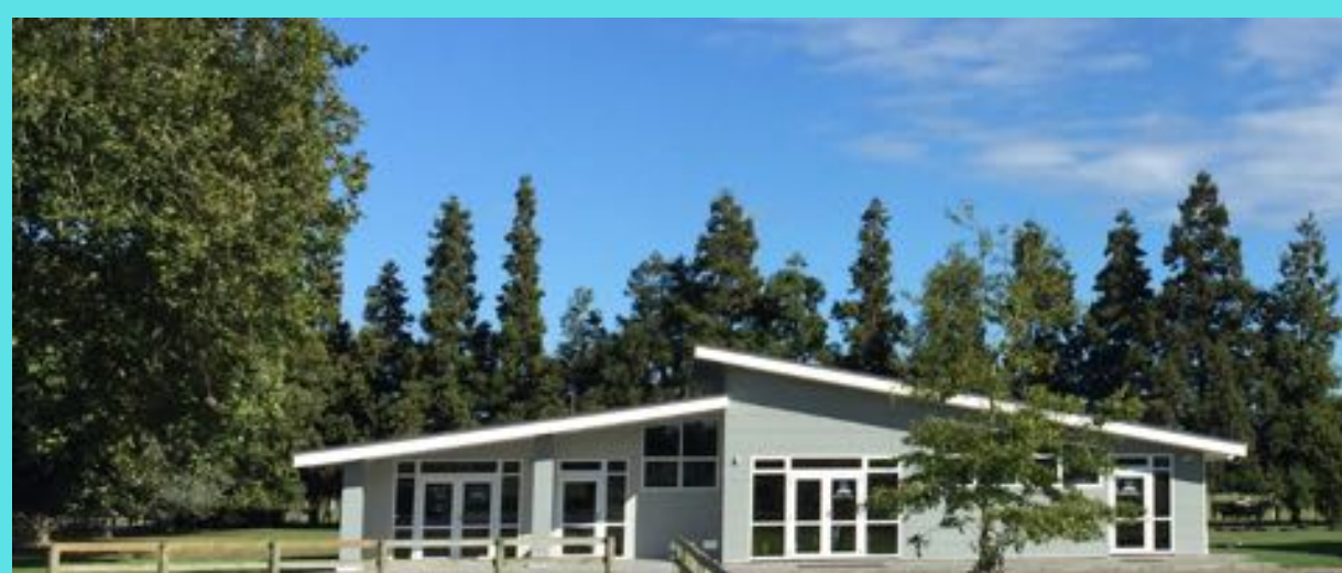
Group by Kaipaki School

Search for the group on Facebook and request to join.